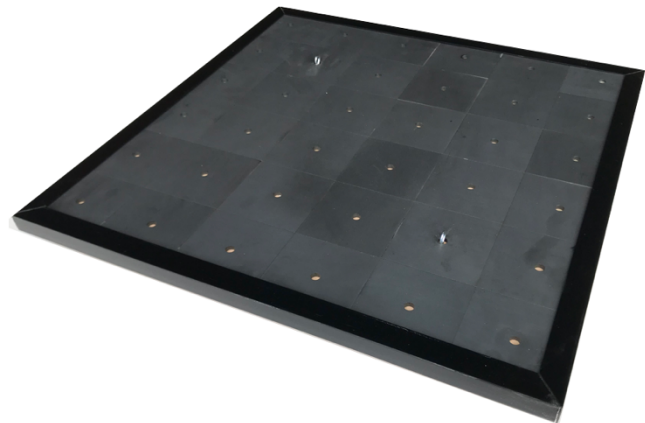
MFB-60 – Representative Image

The MFB-60 is a wheeled board comprising 36 high performance ferrite absorbers with a durable protective perimeter edging for damage prevention. Each board is fitted with 4 x low profile, caster wheels and two eye rings for use with MFT-60 hook rod to aid easy movement of boards inside and outside the chamber. This system is ideal where floor arrangements and immunity patches are regularly required to be adjusted into different configurations.